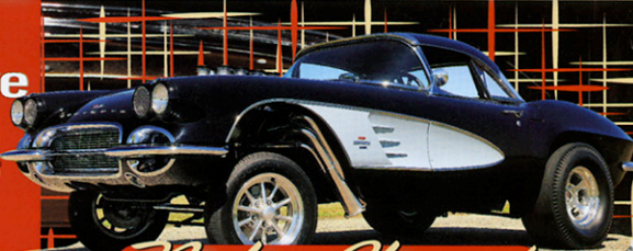
Nickey Chicago's '61 Corvette Gasser #001