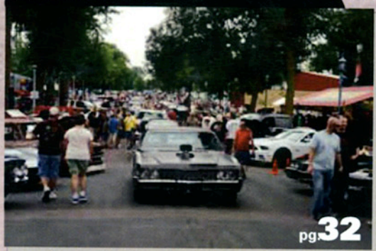
STREET MACHINES PRE-EVENT