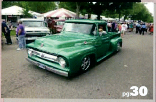
BACK TO THE FIFTIES WEEKEND PRE-EVENT

Classics Plus, LTD. includes a three tiered generation of skilled hands and minds that restore and revive the character of classic cars